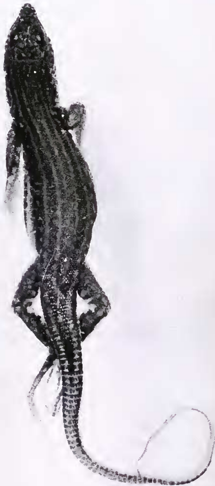
Figure 3. Eremias (Eremias) montanus holotype.

From Eremias nigrolateralis Rastegar-Pouyani and Nilson, 1997 in having a much smaller size, lack of separation of the third pair of submaxillary shields by granular scales (0% versus 100%), lower count of gulars (23-24 versus 41-42), variable number of submaxillary shields (33% versus 0%), reach of femoral